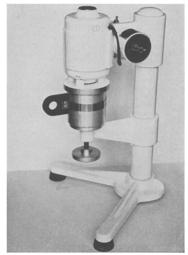
FIG. 1. Stein Mill (Model M1)

Finding the proper mill to grind oil-bearing seeds has been a special problem for each type of seed. Mills such as the Allis-Chalmers experimental roller type of mill described by Zeleny and Coleman (5), the Bauer mill, the Labconco mill, and the Henry nut slicer were employed in preparing ground samples for extraction. In addition, a new model of the Stein mill (Figure 1) previously employed in the dielectric